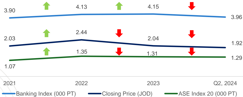
Capital Bank Share vs ASE 20 and Banking Index (Closing Price H1, 2024)