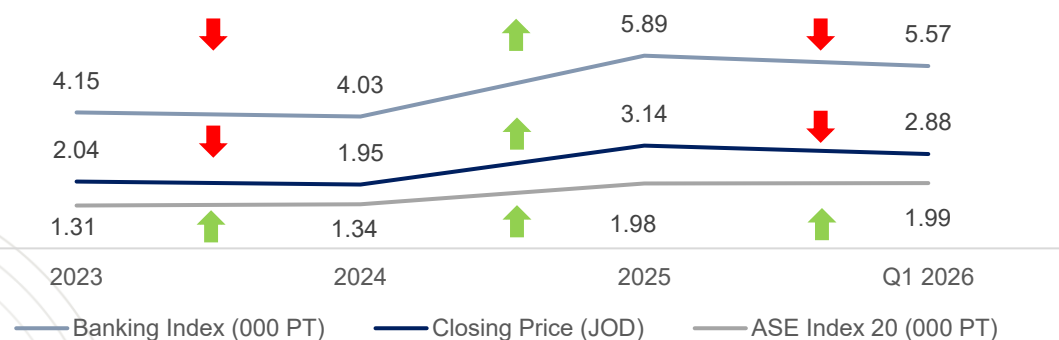
Capital Bank Share vs ASE 20 and Banking Index (Q1, 2026)