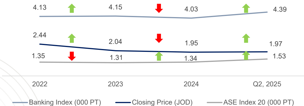
Capital Bank Share vs ASE20 and Banking Index (Closing Price H1, 2025)