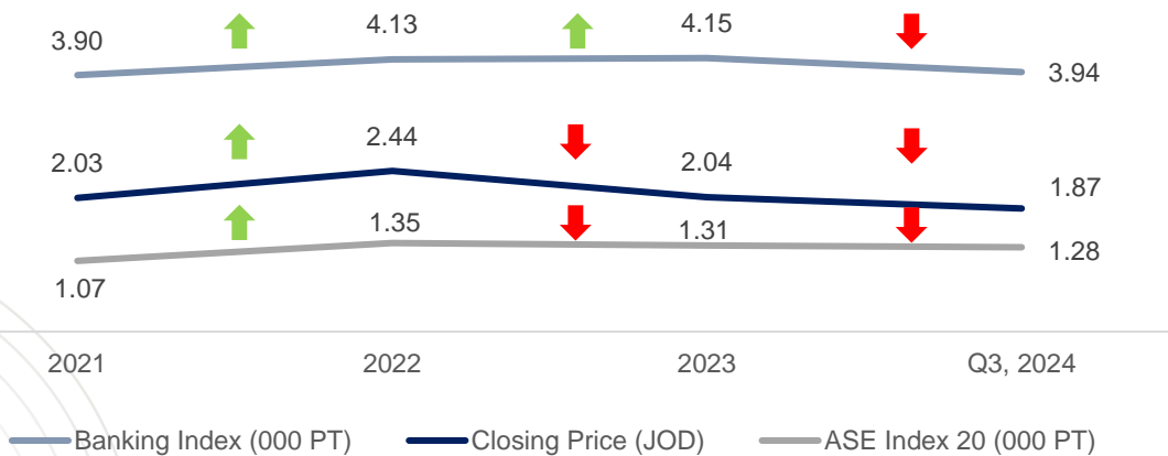
Capital Bank Share vs ASE20 and Banking Index (Closing Price Q3, 2024)