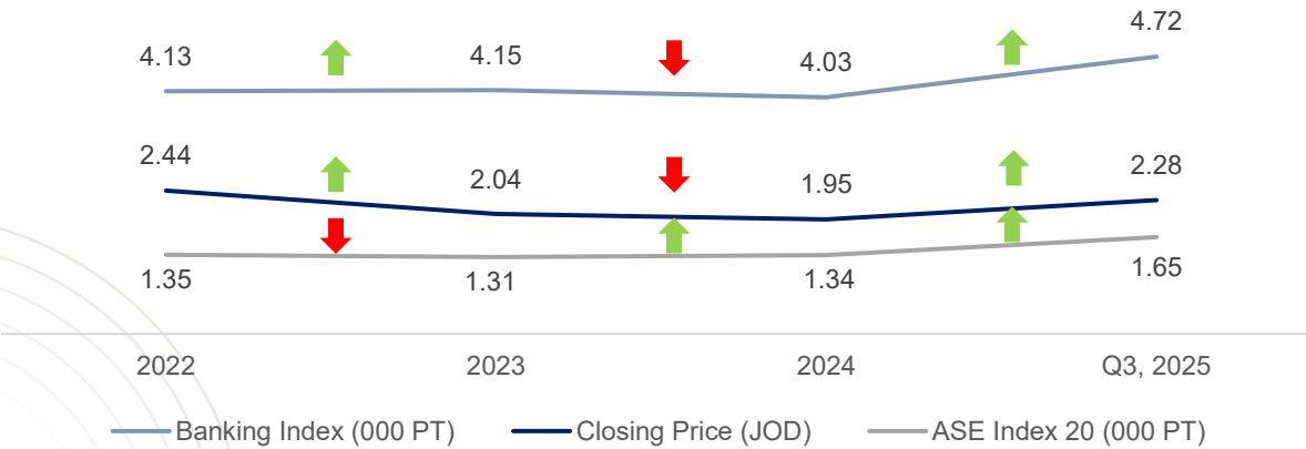
Capital Bank Share vs ASE 20 and Banking Index (Closing Price Q3, 2025)