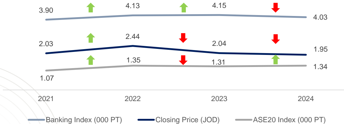
Capital Bank Share vs ASE20 and Banking Index (Closing Price Q4, 2024)