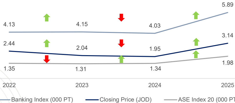
Capital Bank Share vs ASE 20 and Banking Index (Closing Price Q4, 2025)